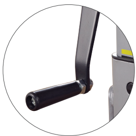
Side crank handle

Oval shaped height adjustable legs from 512-805mm