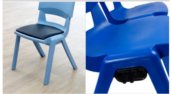
Upholstered seat pads in fabric or vinyl